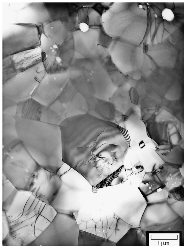
Fig. 1. Annealed mixture (50/50) consolidated in argon at 1500°C with 50 MPa applied stress. Dislocation tangles result from the hot press process.

Typical results of flexural creep are seen in Fig. 2. Post-creep samples appeared white with evidence of crushing damage at the loading points for the high fraction